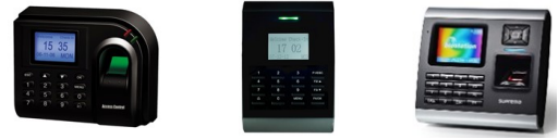
Multiple Reader Options: Dual or Triple Authentication

The KCC is a stand-alone or a network capable unit that can be connected to an Ethernet port. This allows remote administration, adding/deleting users and downloading or checking history. An administrator can even remotely unlock the cabinet.